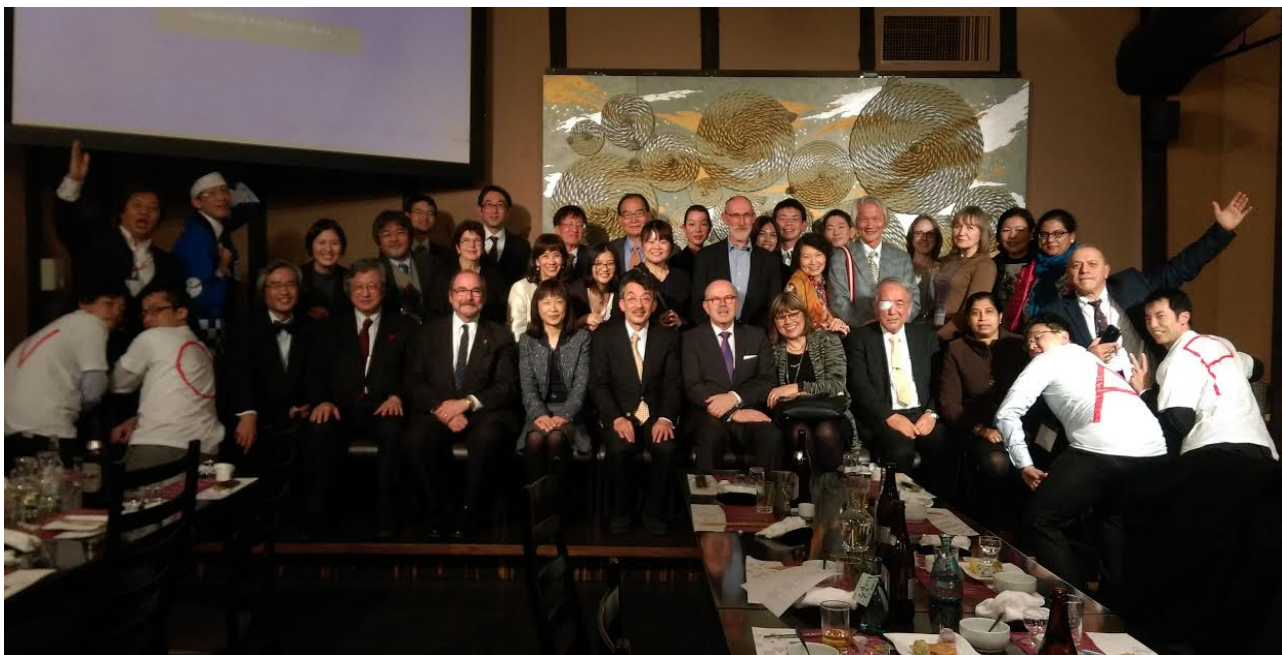
A group photo taken at the farewell party of the 5th WCAP in Fukuoka, 5 March, 2015.

Japanese Young Psychiatrist Organisation and international young psychiatrists offered some entertainings. The highlights were group singings. The songs include Nataru no Hikari which is a famous Japanese song borrowing the melody from Scottish song Auld Lang Syne , bidding farewell and wishing good luck.