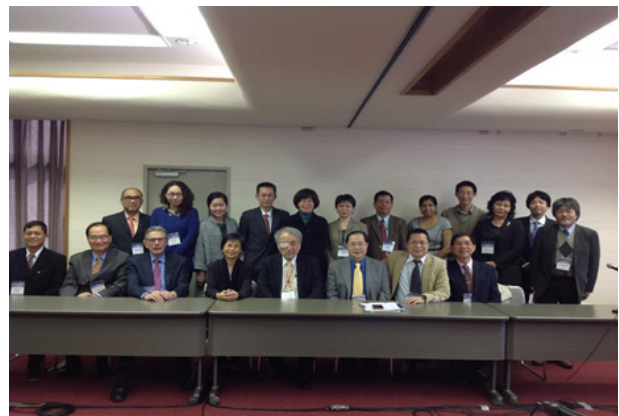
A group photo of Research of East Asian Prescriptions at the 5th WCAP