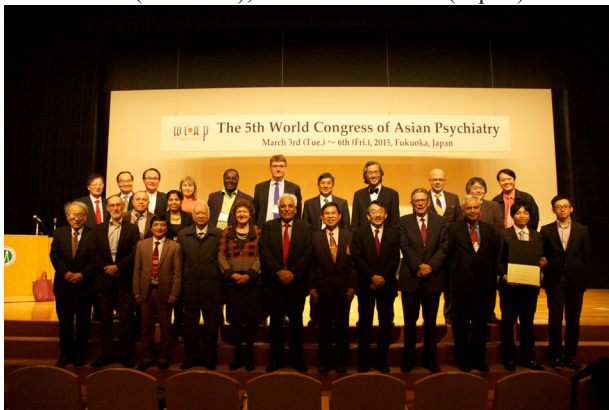
A group photo at the closing of the 5th WCAP in Fukuoka, 3-6 March, 2015