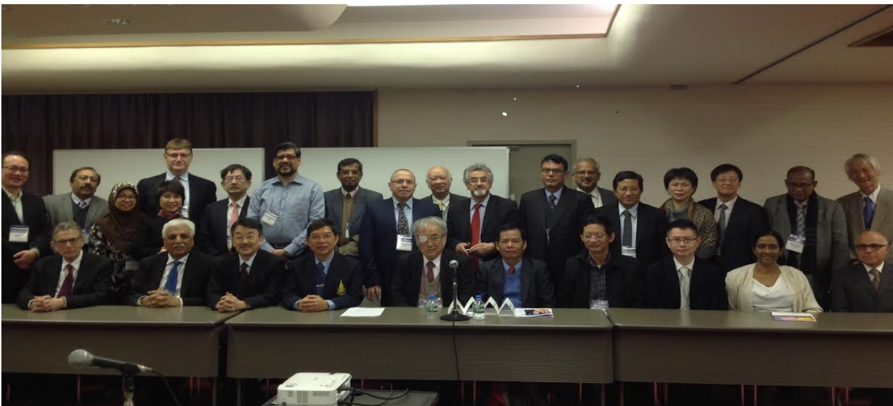
A group photo of the AFPA board meeting at 5th WCAP in Fukuoka