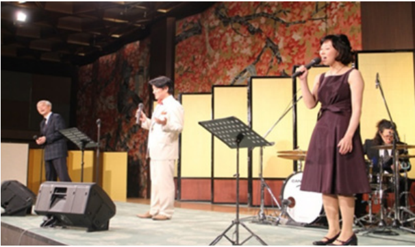
A photo from gala meeting of WPA RC in Osaka in June 2015. .